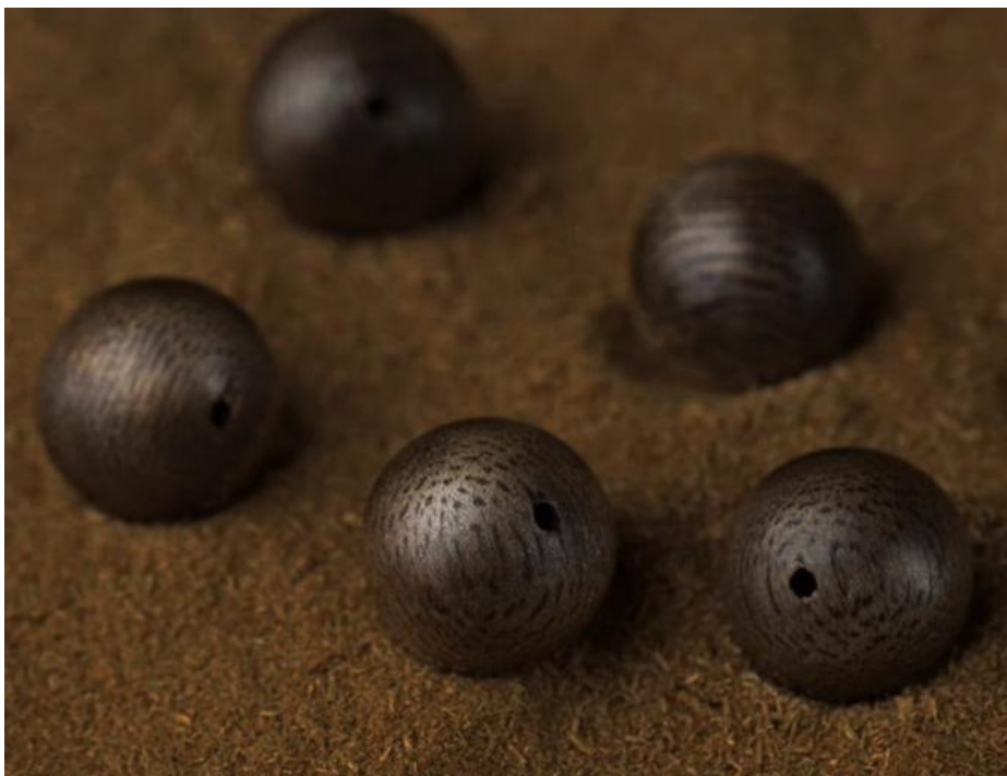
Rich fragrance and unforgettable aroma