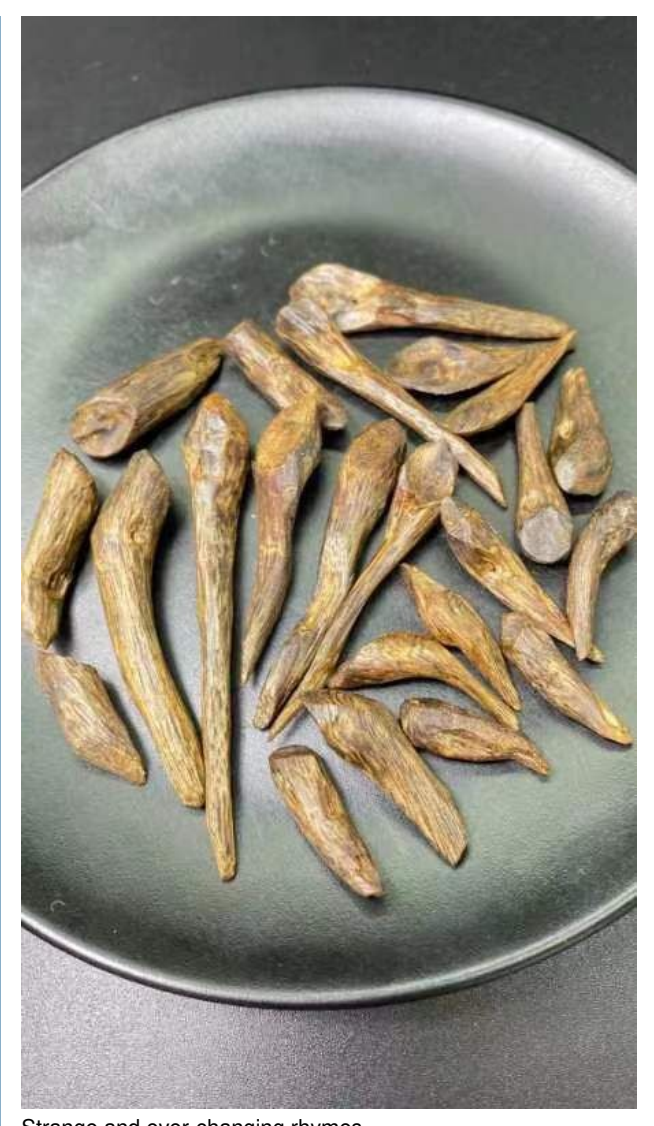
Strange and ever-changing rhymes The aroma is rich and pungent, with a honey aroma accompanied by a hint of mint coolness After heating, the aroma changes endlessly, which is very wonderful