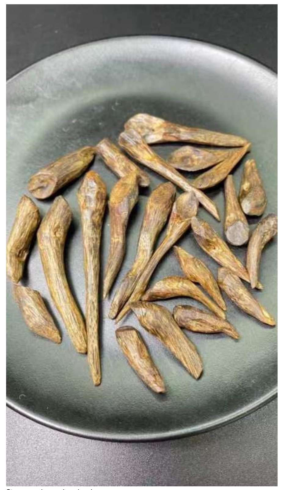
Strange and ever-changing rhymes The aroma is rich and pungent, with a honey aroma accompanied by a hint of mint coolness After heating, the aroma changes endlessly, which is very wonderful