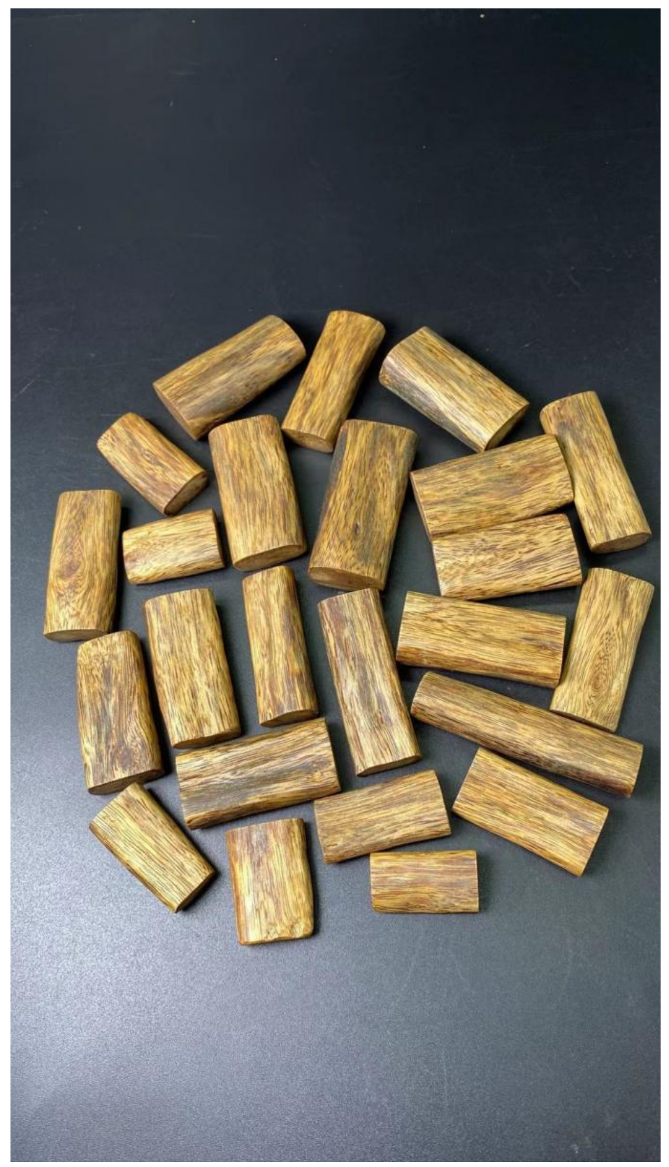
Quiet incense The incense burner heats up, and the Qi Nan oil emits a rich aroma that soothes emotions, making people feel happy both physically and mentally